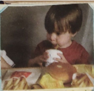
Avoid eating junk food.