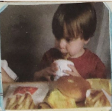
Avoid eating junk food.